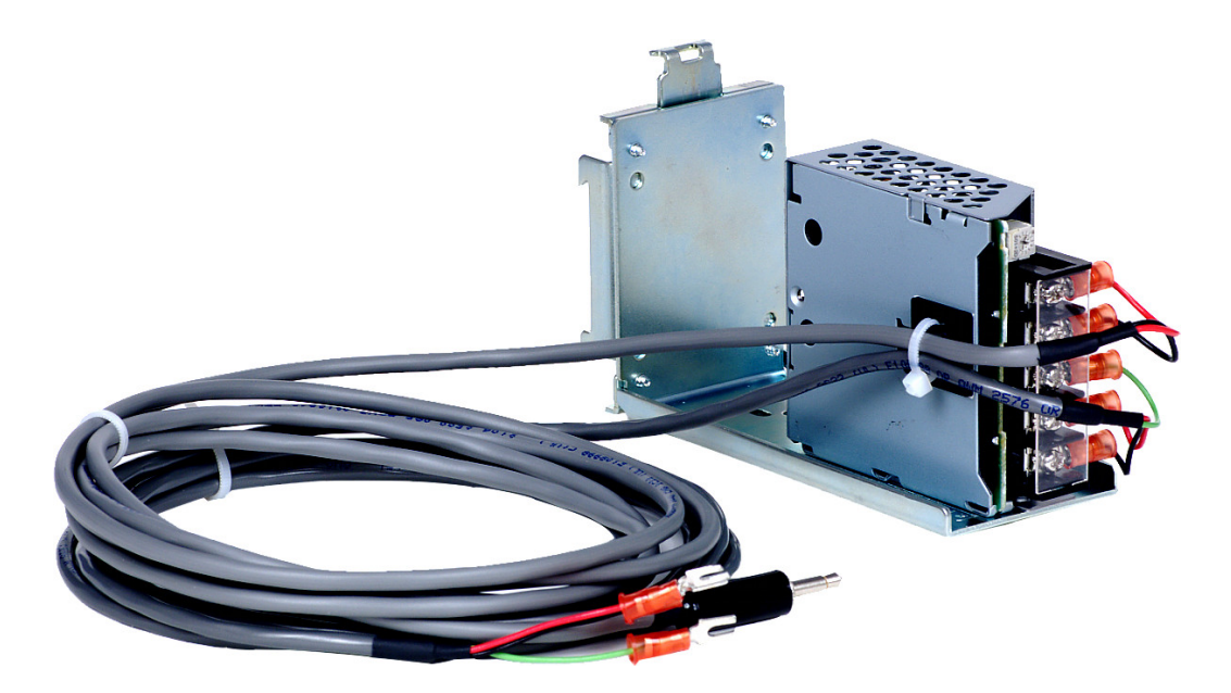
Figure 1: Mounted and Wired Power Supply

The AS0096900 is a DIN rail attachment plate that may be used in mounting the AS0096800 power supply to a DIN rail system. Figure 1 shows the wired AS0096800 power supply, sold separately, mounted on the AS0096900 DIN rail attachment plate. The AS0096900 includes two M3 screws for mounting the power supply to the attachment plate.